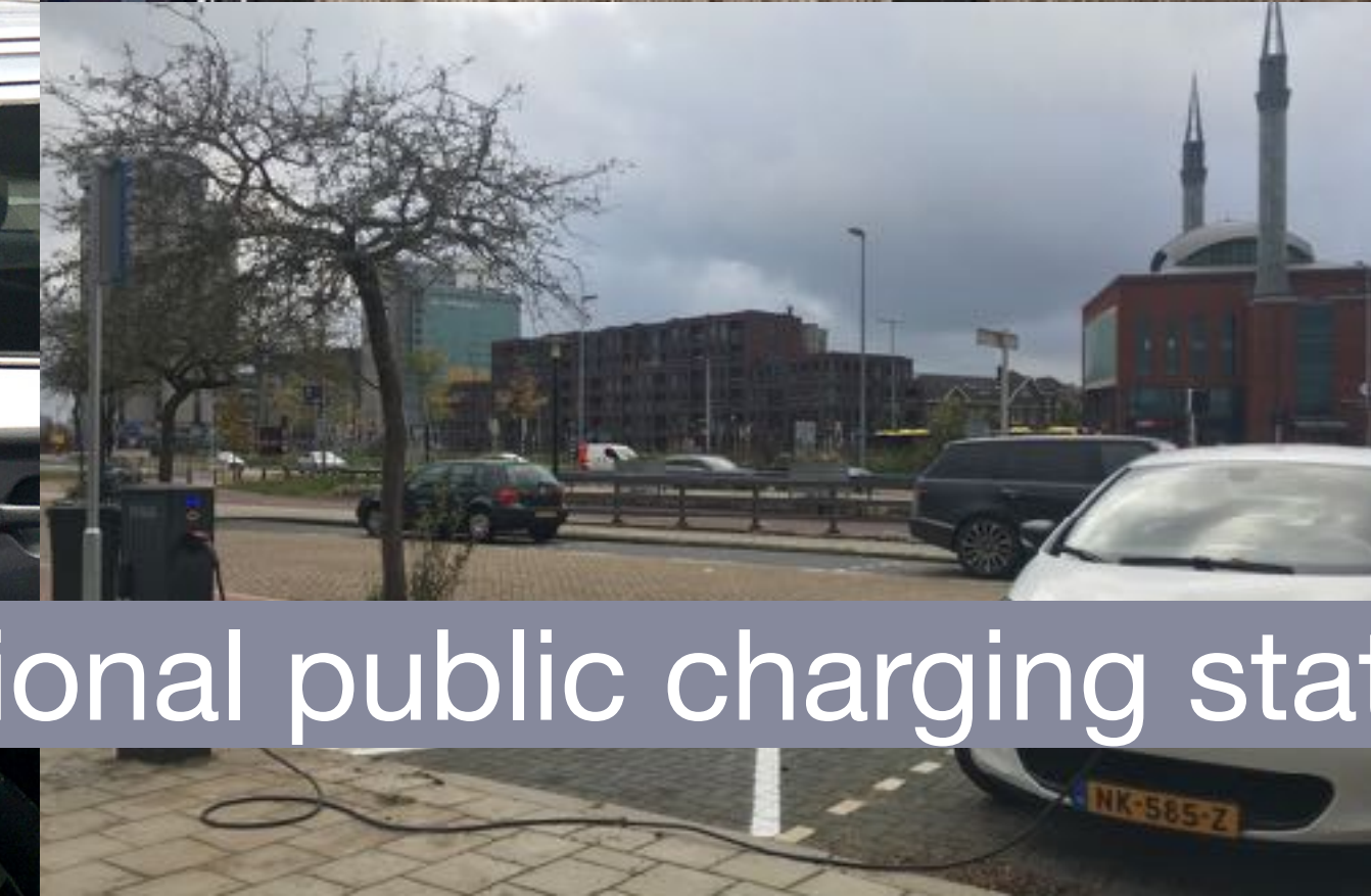
Utrecht 400 bidirectional public charging stations