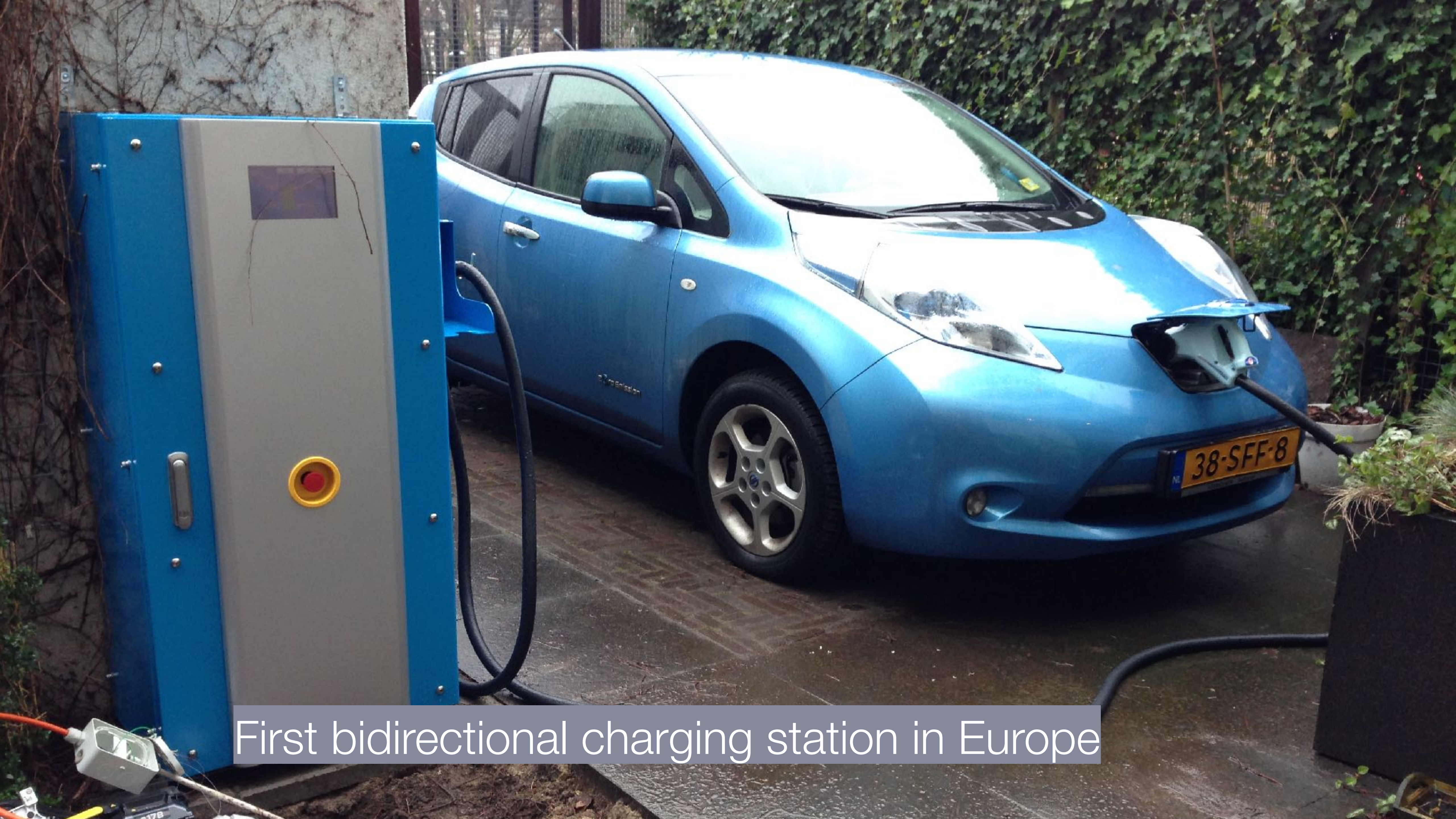
First bidirectional charging station in Europe