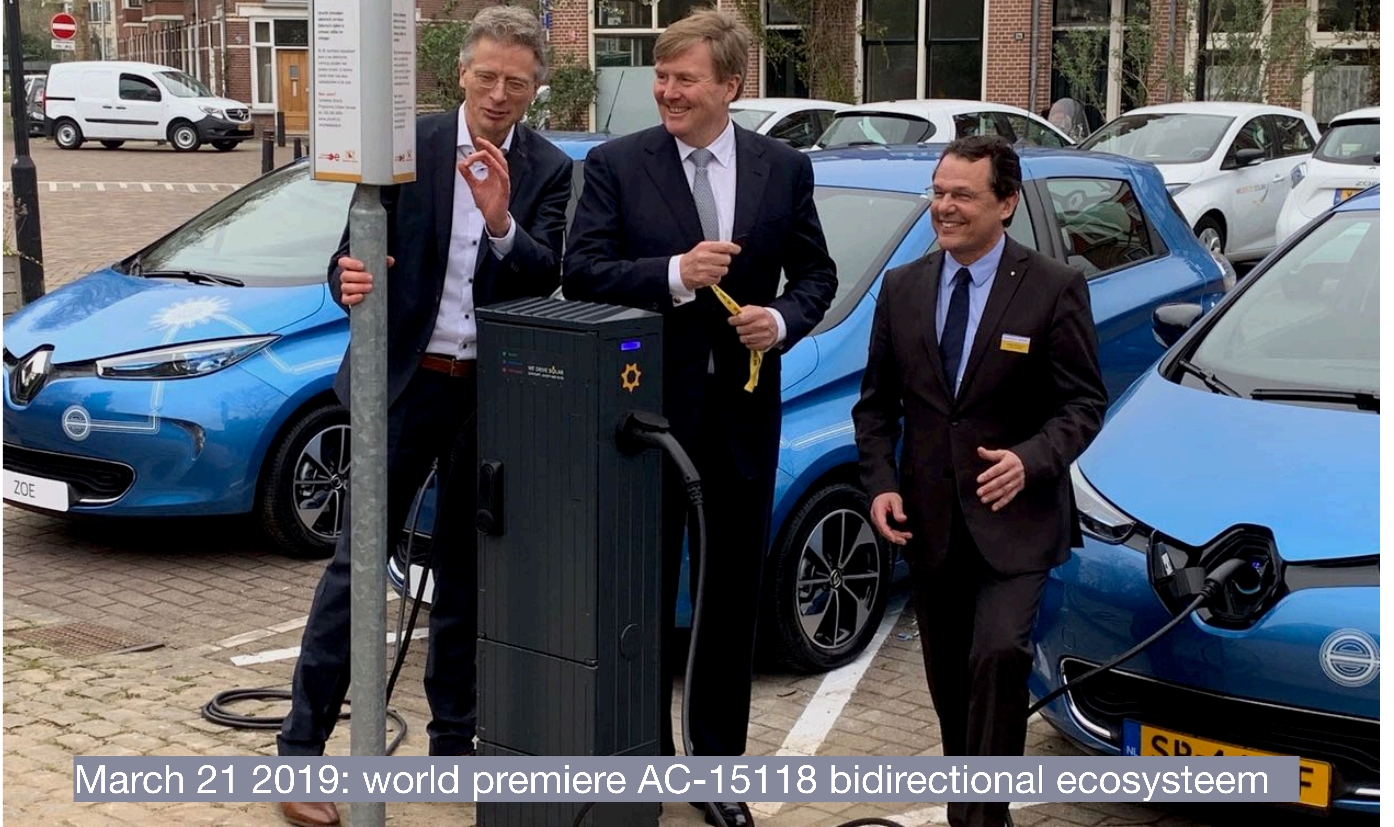
March 21 2019: world premiere AC-15118 bidirectional ecosysteem