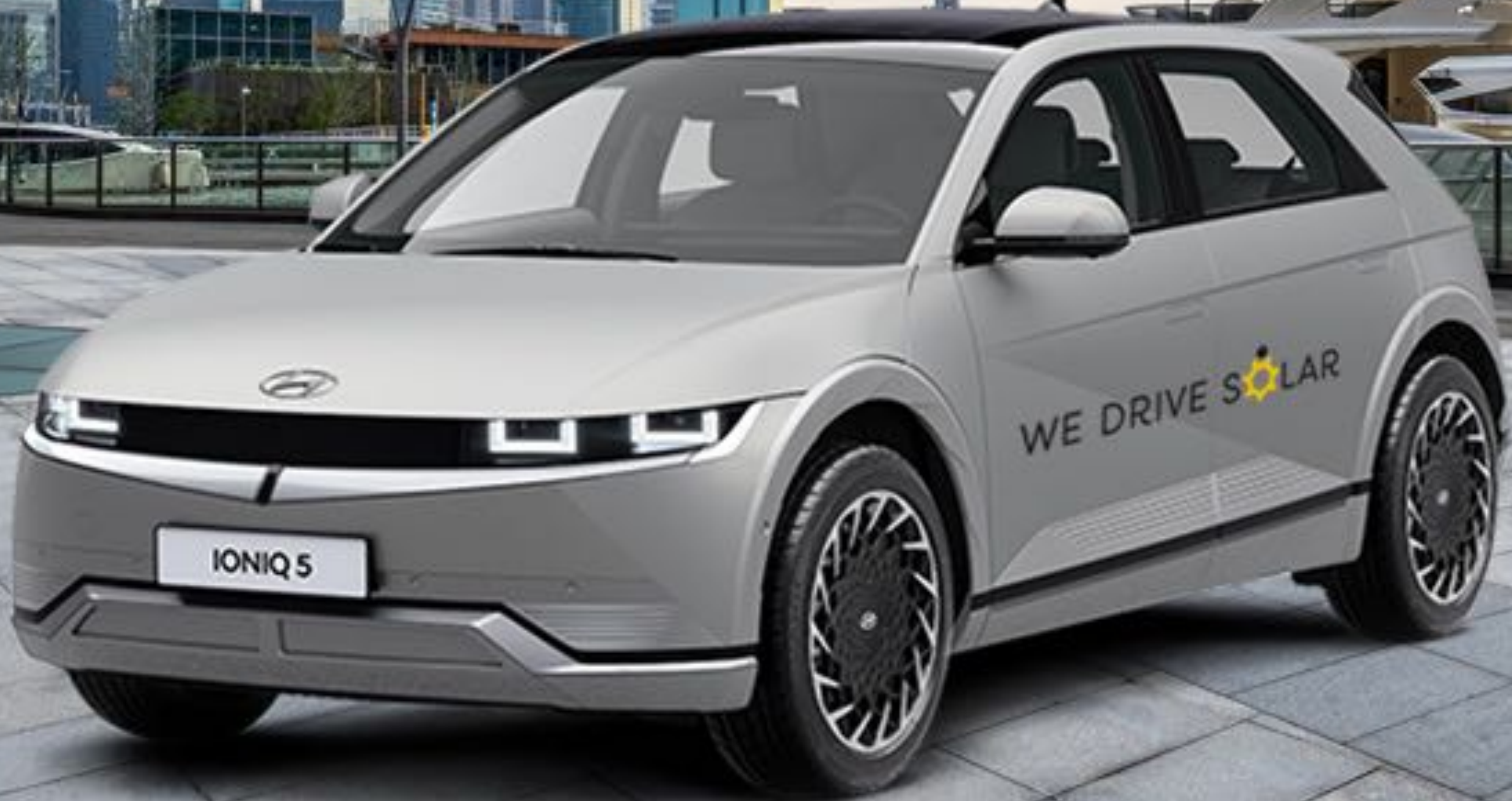
2021: first 25 bidirectional production cars in Utrecht: IONIQ 5