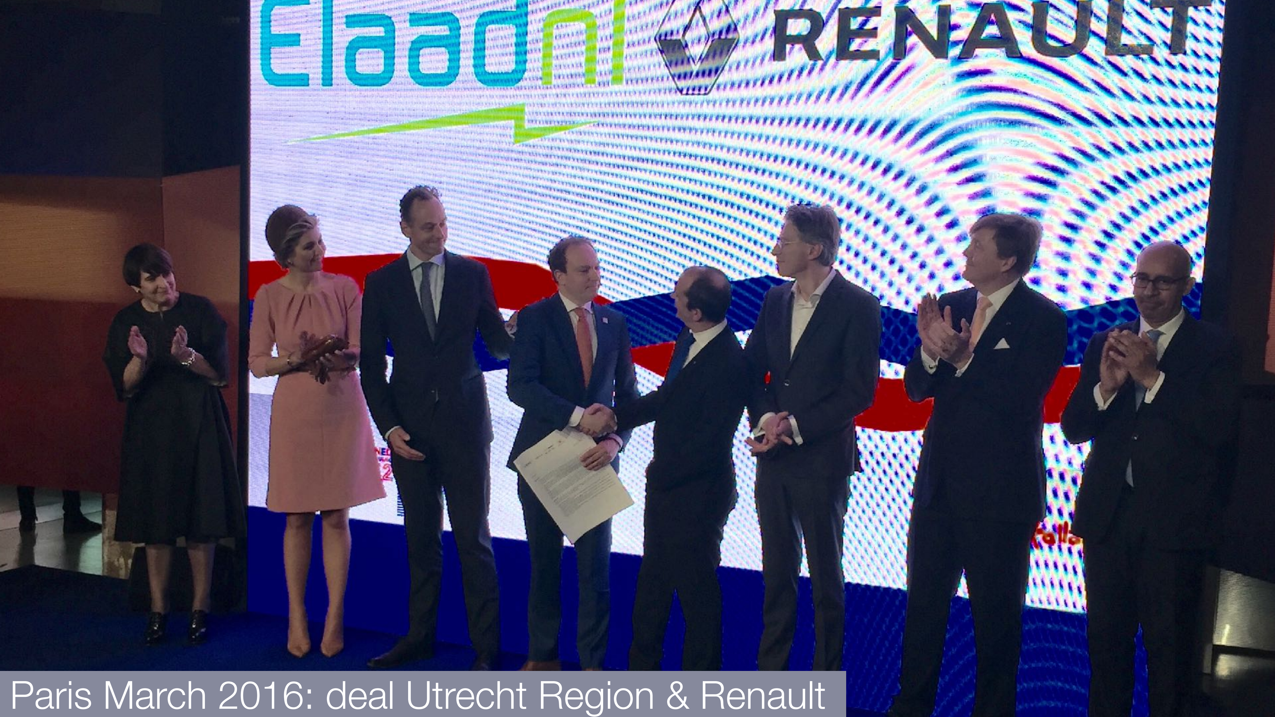
Paris March 2016: deal Utrecht Region & Renault