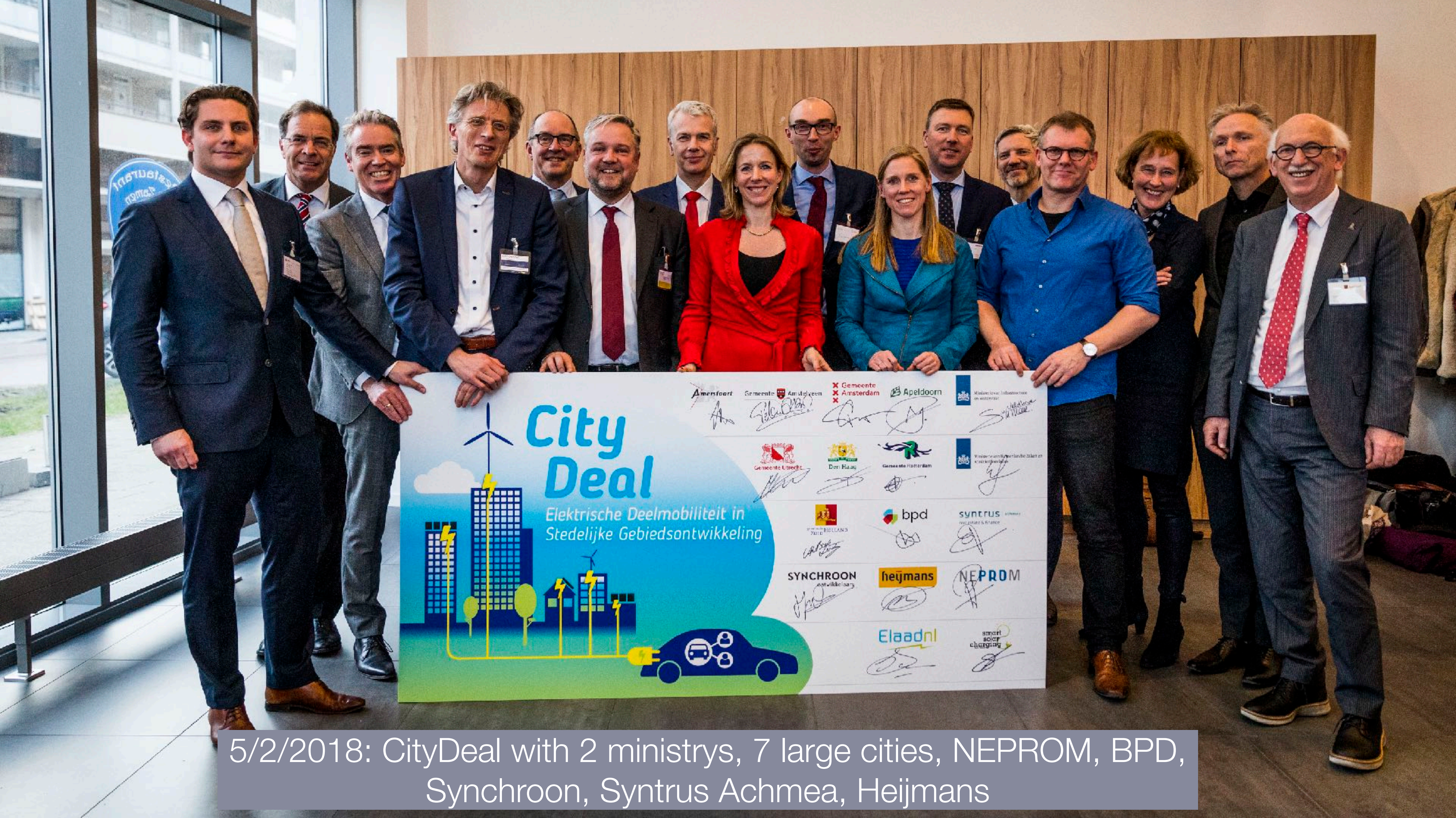
5/2/2018: CityDeal with 2 ministries, 7 large cities, NEPROM, BPD, Synchroon, Syntrus Achmea, Heijmans