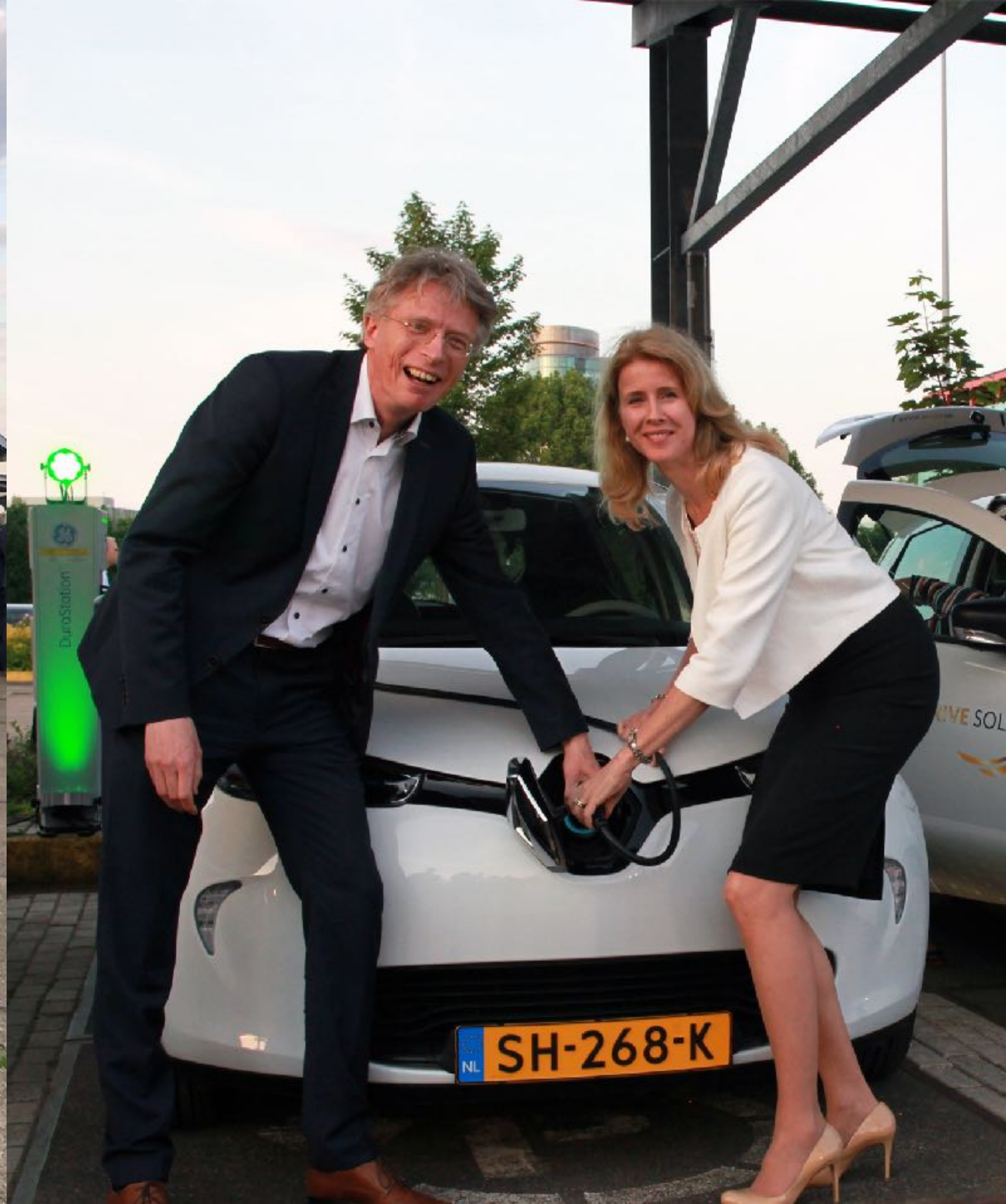
150 cars in Utrecht region, Zoetermeer & The Hague, Amsterdam