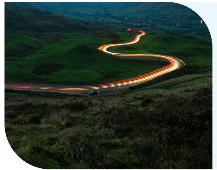
AVERE continuously supported members in their advocacy efforts at the national level

AVERE's dedicated working groups allow members to coordinate on top policy priorities and standardisation/ regulations. They also serve as a forum for the exchange of expertise. The working group structure is driven by our membership's priorities.